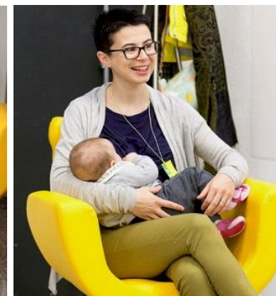
MimmaMà 365900 L