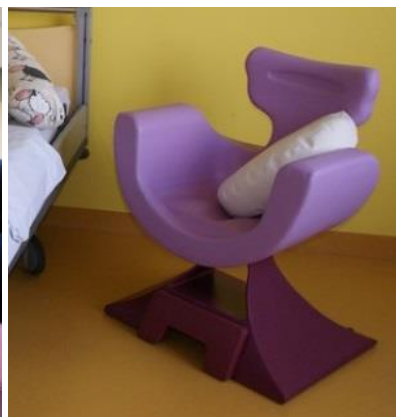
MimmaMà 365900 N