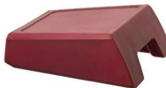
Tuki 365900 P