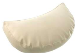
Mabeby 365900 C