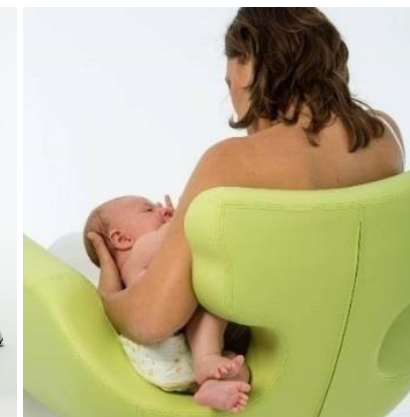
MimmaMà 365900 S