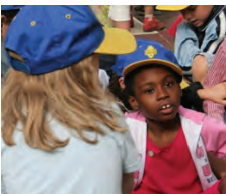
Photo: Nidondolo at Galleana's Park – Piacenza - Italy with a girl with autism, well integrated in the play group. (© Arch. Mitzi Bollani - May 2007)

ACCESS FOR ALL and not just for children with activity limitation. Nidondolo is a new game that works with different modes and for that reason it attracts all children, facilitating their integration and group play.