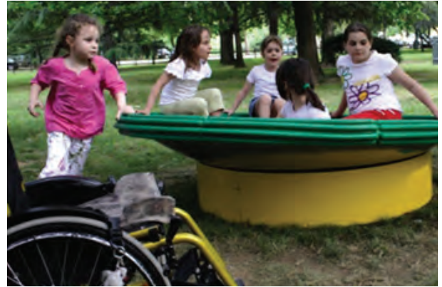
Photos: Nidondolo at Sasso Marconi's Park – Bologna - Italy – Annual Congress of ASBI – Association Spine Bifida Ital