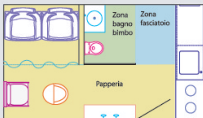
Nursery L Dim: 400x230 cm